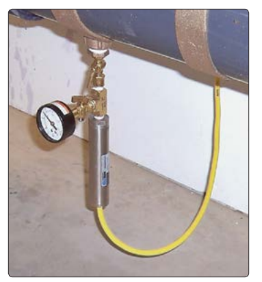
• Model 3400H and Dial Gauge Pressure Transducer on a tee fitting.